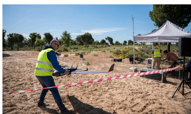
Real-time data collection (Doñana)

Validated in pilot tests in Barcelona, Bristol, Salzburg and Rhodes (for the extreme weather events feature), in IPTO grid , Greece (healing in a large-scale islanding scenario), in Estabanell grid , Spain (healing cyber-attacks), and in e-Distribución grid in Doñana National Park, Spain (for heat waves feature)