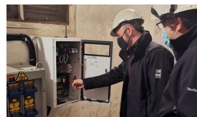
Cyber-attack feature validated in Estabanell grid